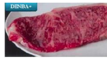
In DENBA field